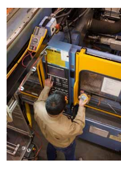
Fluke. Keeping your world up and running.®